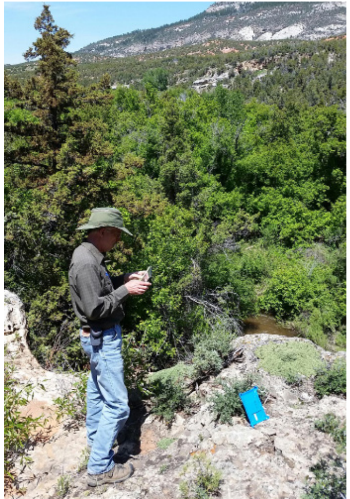
Above Canyon Creek

The preserve is home to eight plant communities and more than 120 bird species, as well as mountain lion, black bear, elk, beaver and the remarkable spotted bat. Several rare plants—some found only in the Bighorns—also inhabit this unique landscape. Additionally, mule deer, elk, pronghorn, black bears, mountain lions and coyotes can be found here, as can many species of bats and birds of prey.