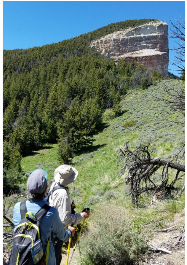
Heart Mountain hikers

Shoshone Indians called this area "Home of the Birds"—golden eagles, sage thrashers, peregrine falcons and sage-grouse thrive here. Native wildlife such as elk, mule deer and pronghorn can be seen, and common predators such as mountain lion, bobcat, coyote and black bears roam nearby. Rare plant species live in great concentrations on the preserve, such as the cushion plant, Howard's forget-me-not, Snake River cat's eye, aromatic pussytoes, Absaroka goldenweed and more.