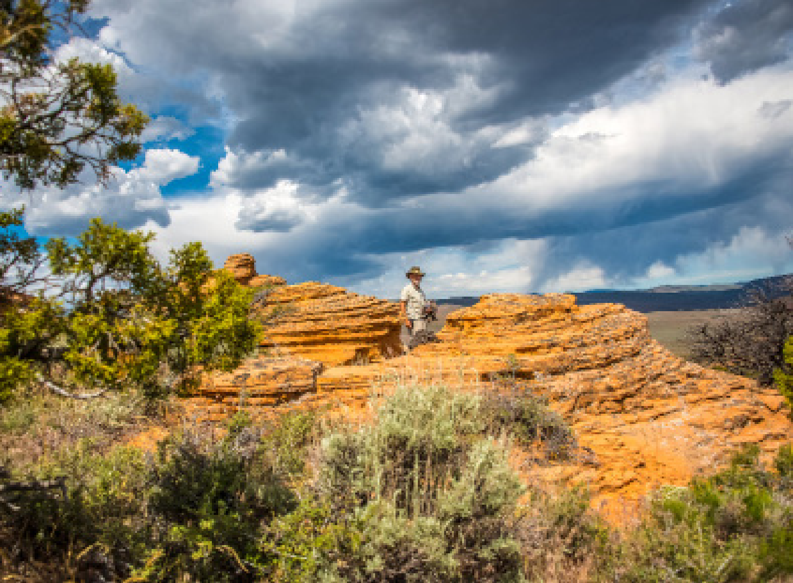
Red Canyon hiker