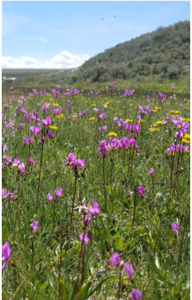
Shooting Stars

Streamside willow and other plant communities dominate the area and support an abundance of native plants, including the rare meadow pussytoes. Meadows transition to Wyoming big sagebrush and mountain big sagebrush communities in the uplands, where visitors can catch sight of pronghorn. Moose, mule deer, elk, porcupine and beaver can be found along the river and white-tailed prairie dogs can also be seen here. Sage-grouse, white pelicans, sandhill cranes, great blue herons, killdeer and mountain bluebirds make the area their summer home.