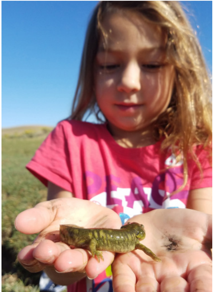
Child with tiger salamander

Five species of large game animals—moose, bighorn sheep, elk, mule deer and pronghorn—find forage and cover here. Miles of streams and river foster robust trout populations, and large predators such as mountain lion, black bear and a variety of birds of prey attest to the vitality of this working ranch.