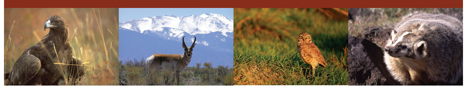
The golden eagle, pronghorn antelope, burrowing owl and badger are among the numerous animals that share habitat with the sage-grouse. Shown left to right