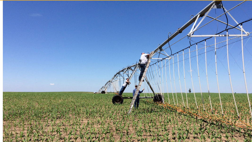
Mobile drip irrigation applies water directly to the soil's surface, eliminating wasteful water evaporation.

With a $25,000 C-PACE loan, a farmer could finance mobile drip sprinkler heads for an existing center-pivot irrigation system to make water use more efficient with no up-front investment. C-PACE financing can be used for many other agricultural applications, from solar cattle shields to reverse osmosis filtration systems.