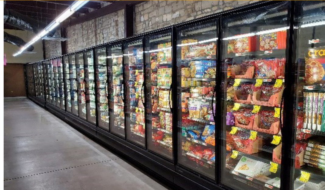
Peabody Grocers recently replaced the doors on 26 freezer units to improve energy efficiency.

If C-PACE had been available, her project financing would have been simpler with lower annual payments—enabling her to pursue other improvements. C-PACE also works alongside programs like REAP grants and Investment Tax Credits so business owners can access millions of dollars in federal incentives. Small businesses like the Peabody Market already operate on slim margins. They need options like C-PACE to remain viable and serve their communities.